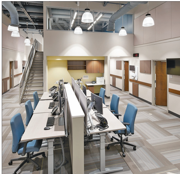
Above, Riedman Health Center staff area and mezzanine.

Dixon Schwabl is well-known for its emphasis on wellness.