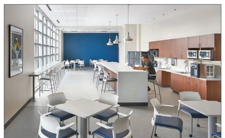
Above, the Riedman Health Center staff lounge.