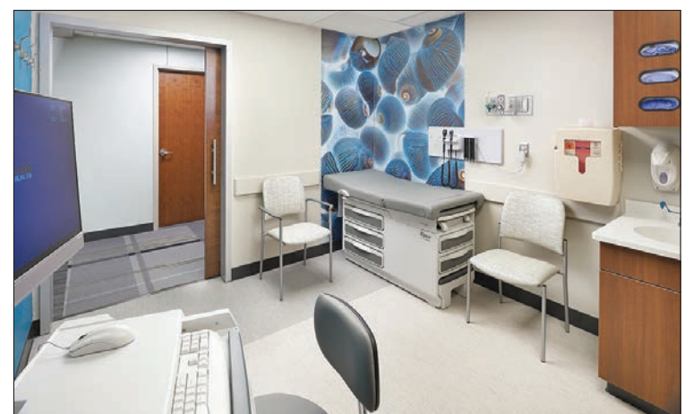
Above, a Riedman Health Center examining room.

CPL designed the corporate headquarters for Analog Devices in North Carolina. The 27,000-square-foot building includes sit to stand desks; a green wall at reception; and a wellness room that includes an undercounter refrigerator, recliner, side table, and six lockers.