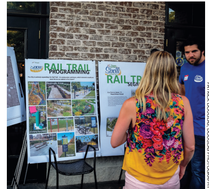
PATRICK DOUGLAS, DOUGLAS PHOTOGRAPHY