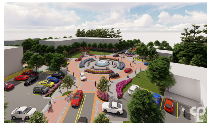
▲ Plaza Improvements: Rendering depicts various proposed elements of placemaking such as roundabouts, pedestrian improvements, and pocket parks.