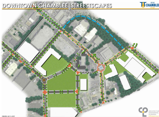
▲ Chamblee Broad Street: A planview of conceptual Chamblee streetscape improvements by CPL.